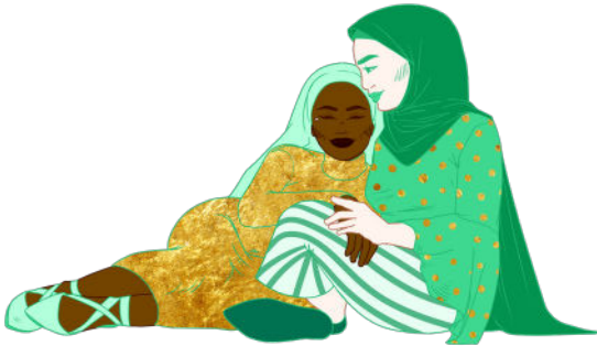
Image Description: Two hijabi Muslims sit together and hold hands.

“I sometimes felt like I wasn’t queer enough for society...I wondered if I would be more acceptable to people as a queer hijabi if they knew I had short hair and if I rejected any identity that would associate me with my Arabness or Muslimness? But I learned to be unapologetic about my Muslimness in queer spaces, forcing people to realize that queer Muslims exist.”