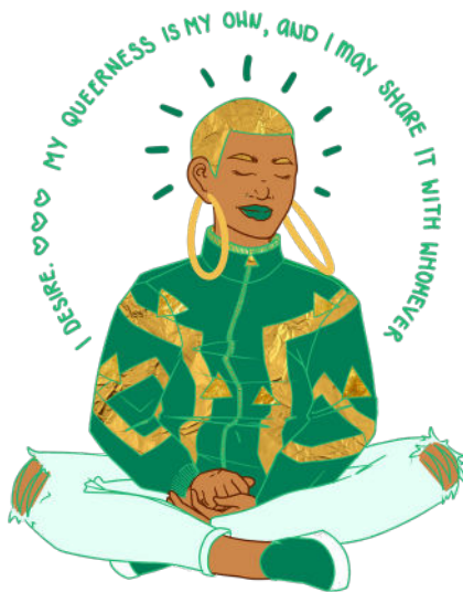
Image Description: Nonbinary Muslim sits in peaceful position as the words "My queerness is my own, and I may share it with whomever I desire" circulate around their head.