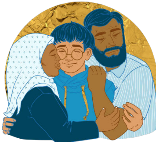
Image Description: A young queer Muslim with glasses in a loving embrace with their parents on either side. A hijabji woman kisses them on the cheek and a bearded man rests his head on theirs.

Check out the #MuslimAnd hashtag on social media and I Am Not Haraam on tumblr for more affirmation and access to posts written by and for queer Muslims: iamnotharaam.tumblr.com