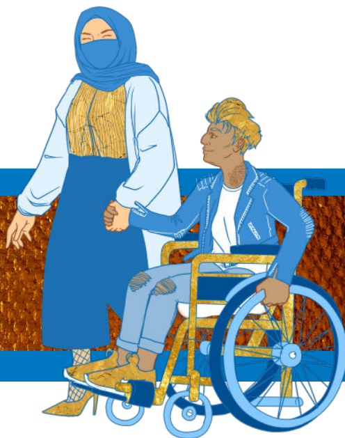
Image Description: A Niqabi Muslim holds hands with a nonbinary Muslim using a wheelchair

Remember: your sexual orientation and gender identity are only one part of who you are. You are a complex human being with a multitude of identities, aesthetics and interests.