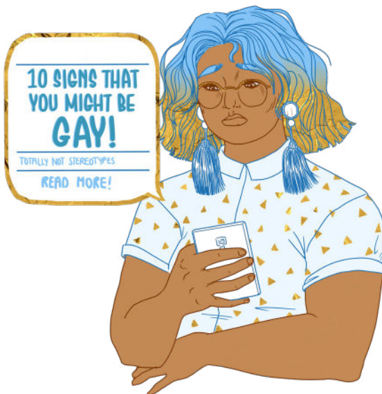
Image Description: A young person, with a thoughtful look on their face, reads an article on their phone titled "10 Signs That You Might Be Gay!"

"I didn't have one moment when I realized I was attracted to women. I think it came to me gradually and I didn't really have the words for it at first. I struggled for a while looking for language because I wanted something rooted in Arab culture but these days I use the label of lesbian or Queer."